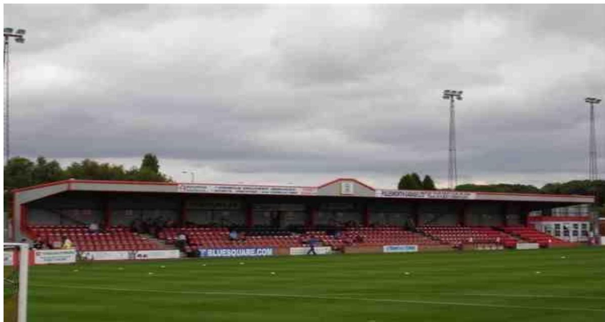
The Main Stand

Although the ground is on the small side and gets its name from a former pub called the Lamb Inn, it is well maintained and has a capacity of 4,100. The Main Stand all seated covered stand that straddles the halfway line of the pitch and has a capacity of 526 seats.