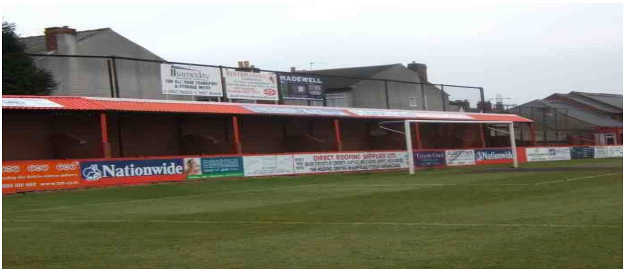
The Meadow Street End

Take the M6 to junction 12 then take the A5 or you can take the M6 Toll road and get off at junction T4 and follow the signs for A5 and Tamworth then at Bonehill Roundabout go into to Tamworth and follow the signs for Tamworth FC and Snow Dome.