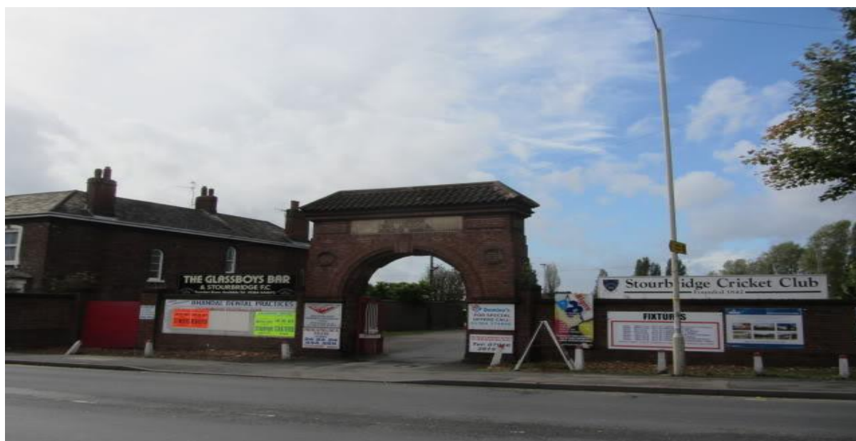
Entrance to the ground

Under 16's £3 or under 11 Free with Adult