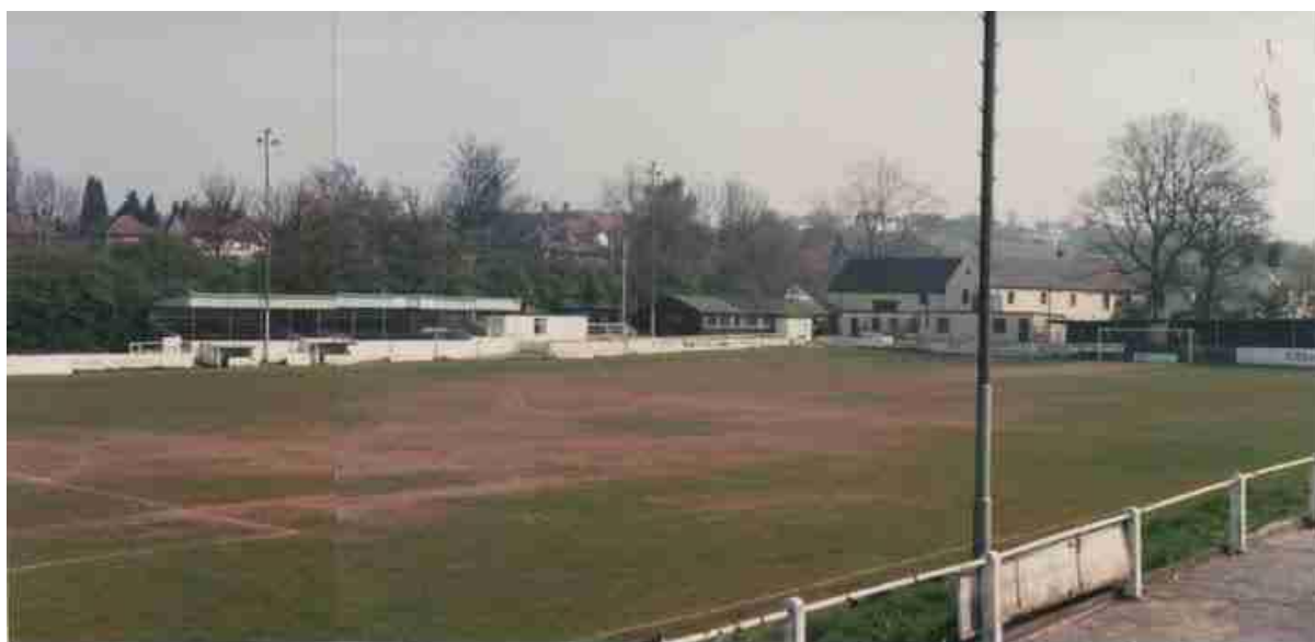
The Old Ground now under Keys Avenue